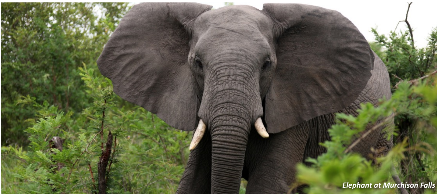
Elephant at Murchison Falls