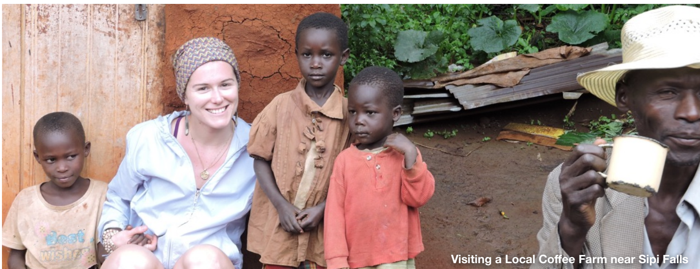
Visiting a Local Coffee Farm near Sipi Falls

We will provide bottled water for drinking during the day. We will have our own transportation everywhere we go as a group, to and from all our partner villages and to all our activities. We'll be hiking in beautiful Sipi Falls and finishing our trip with an amazing 3 day wildlife safari in Murchison Falls National Park where you'll see exotic wildlife.