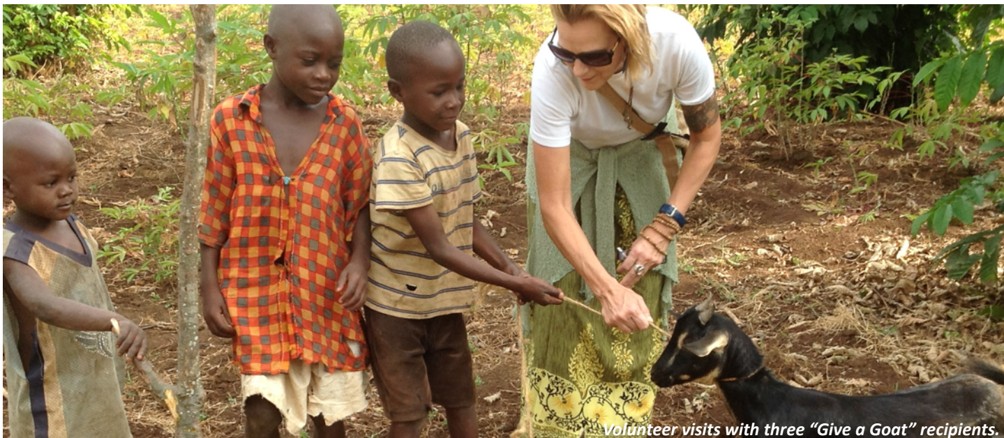
Volunteer visits with three "Give a Goat" recipients.